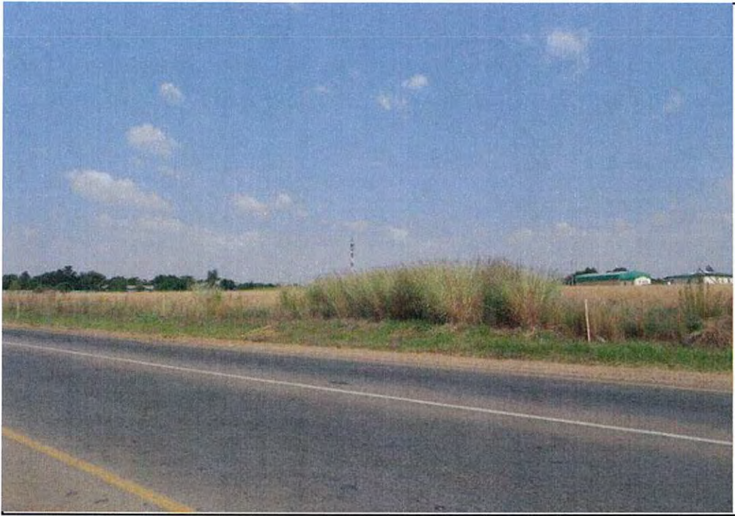
Eastern View of site from North Boundary