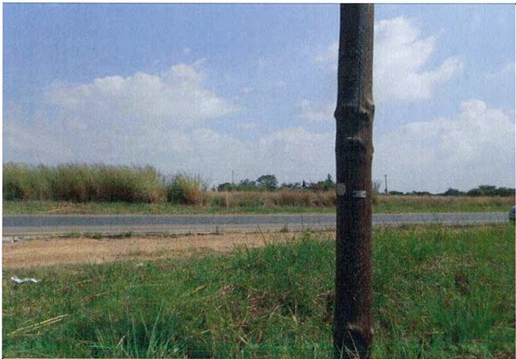
South View From 11KV connection pole to position of Minisub - Note road crossing is required.