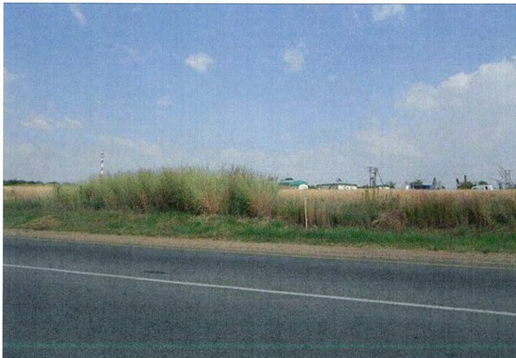
Eskom Minisub will be located behind the long grass on the North Boundary