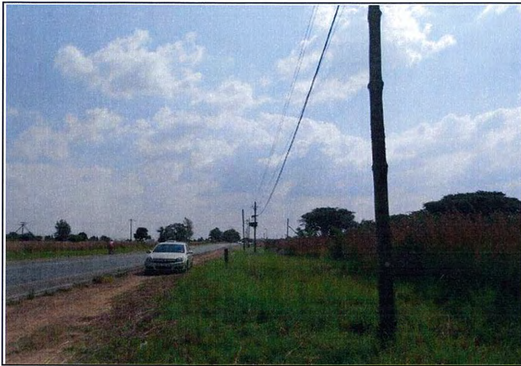
View along 11KV line running West to East along the North Boundary of Summit road - Closest pole is where power will be tapped off.