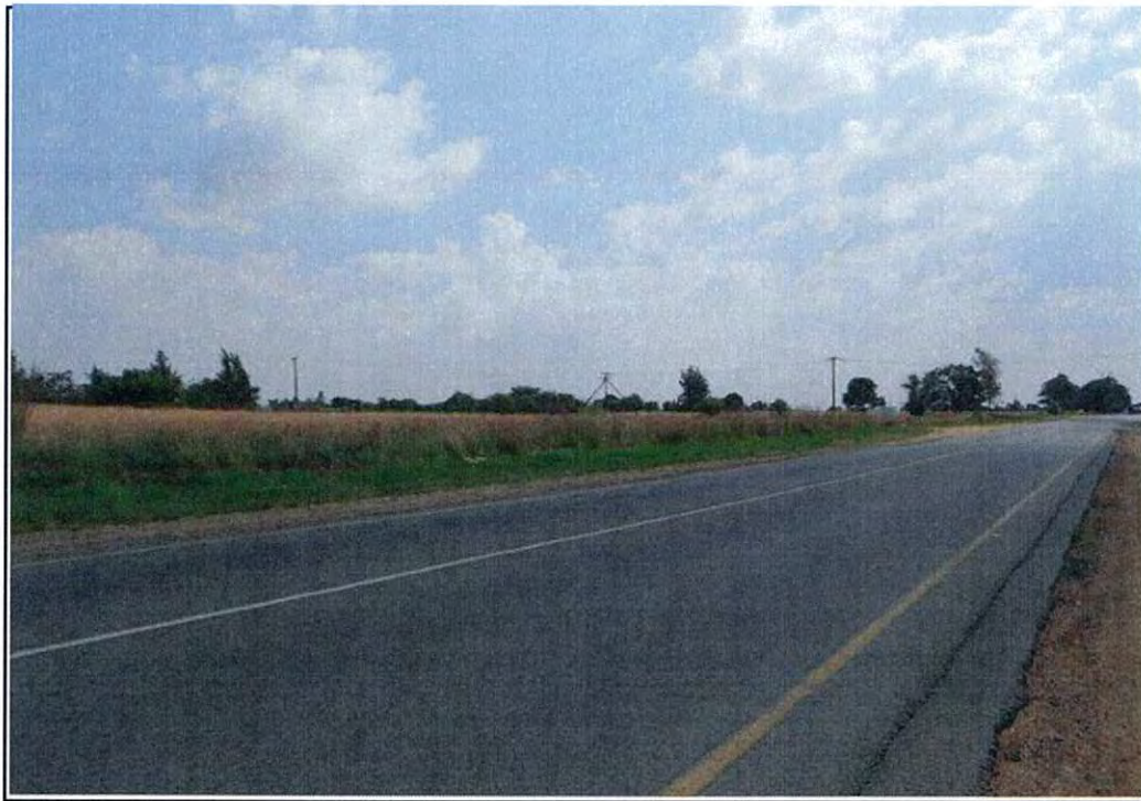
South West View From North Boundary showing 11KV Spur line on West boundary.