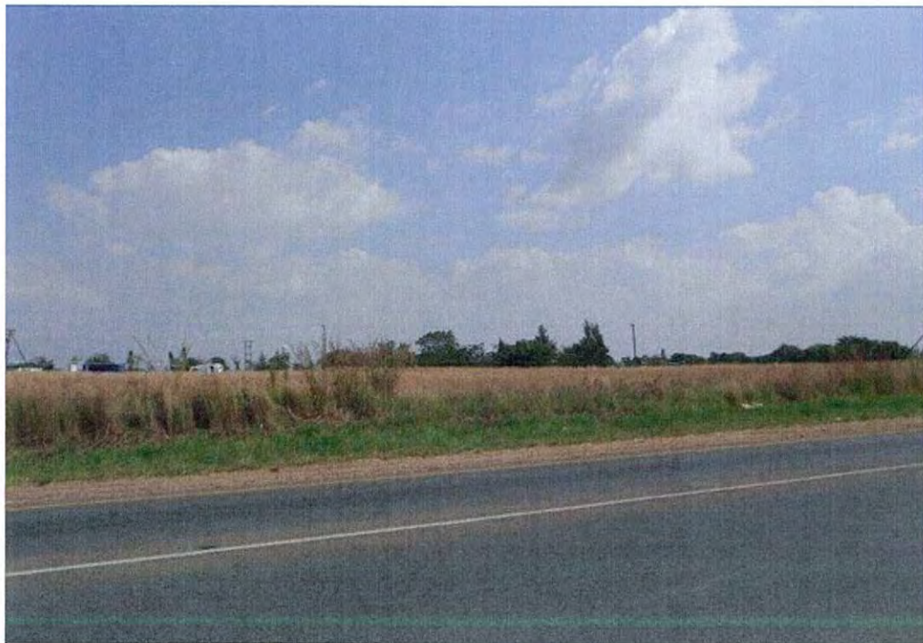
View of Site from north boundary - Note 11KV spur line on South Boundary could also be used as a point of supply.